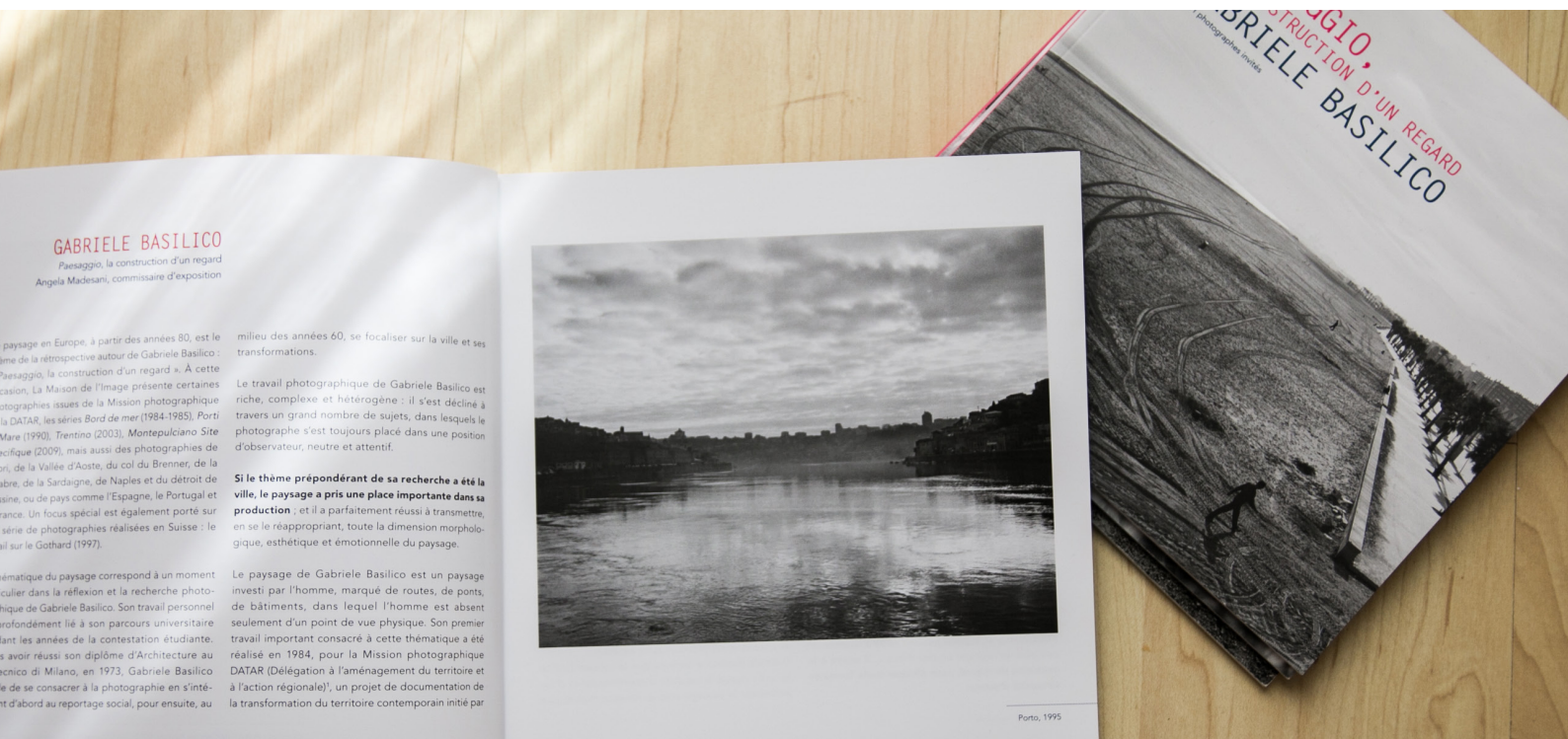
the catalog of the 2016 th edition

Every year la Maison de l'Image publishes a catalogue gathering all projects participating in the main exhibition. Each call of proposals winner will present his/her work on four pages of the catalogue as a trace of the festival.