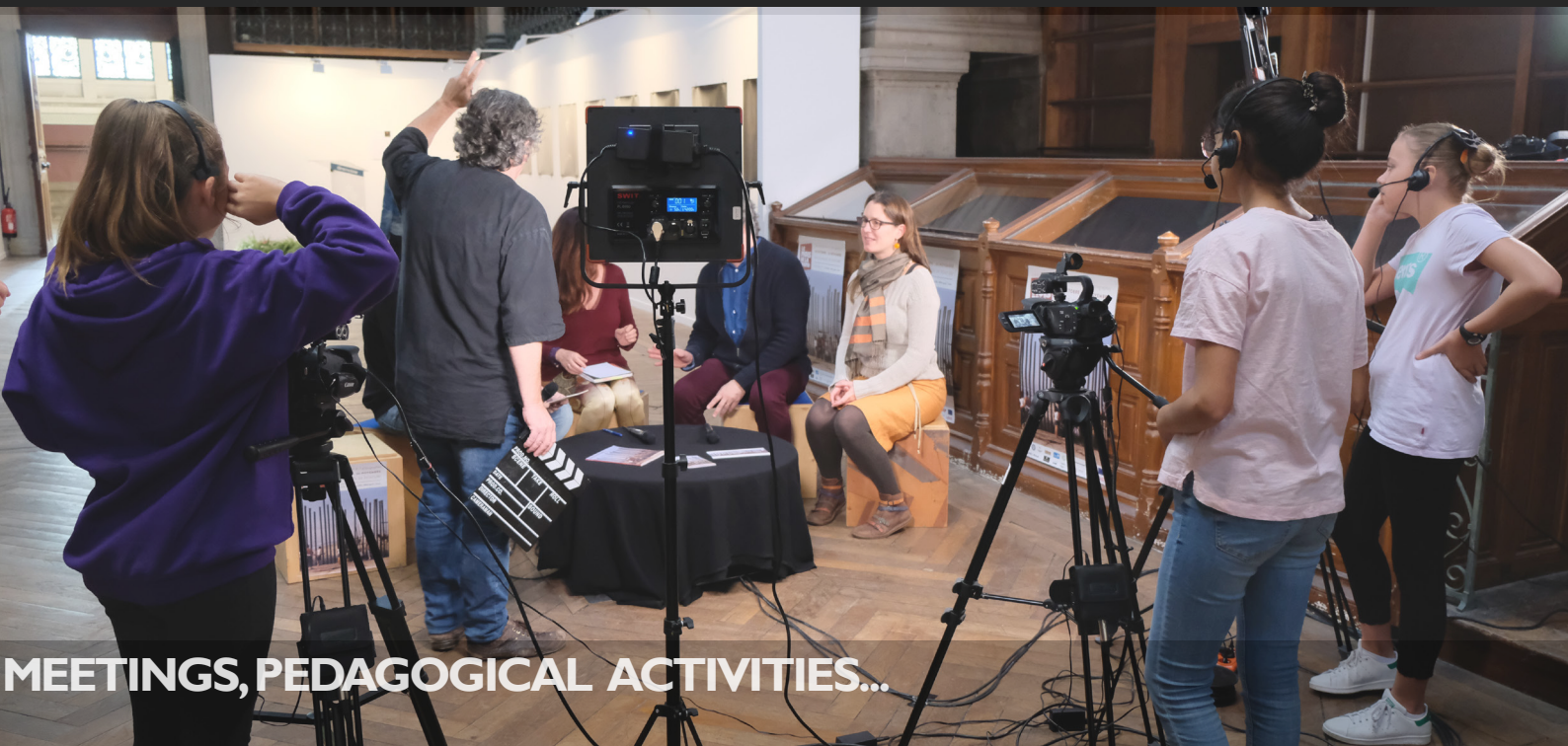
MEETINGS, PEDAGOGICAL ACTIVITIES...