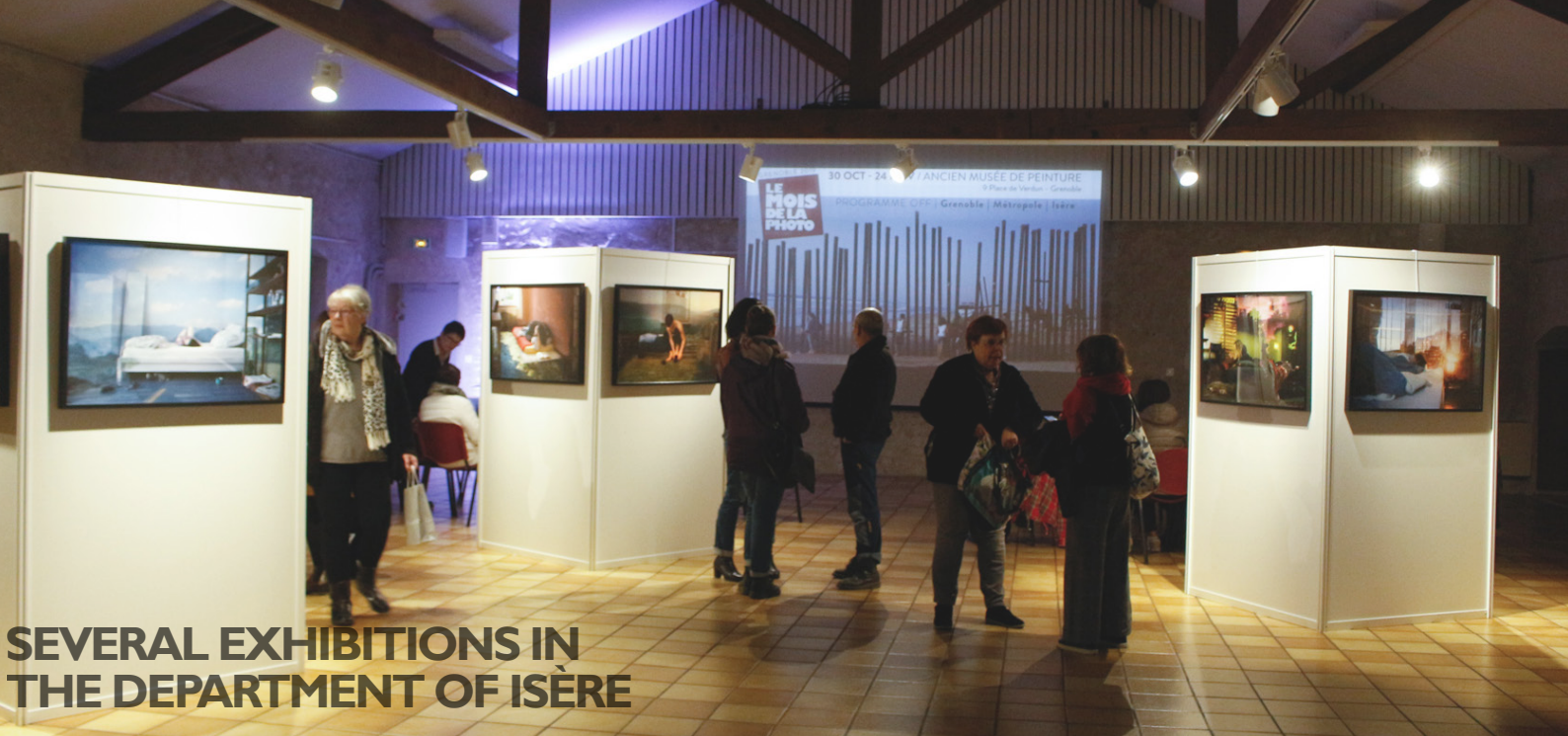
SEVERAL EXHIBITIONS IN THE DEPARTMENT OF ISÈRE