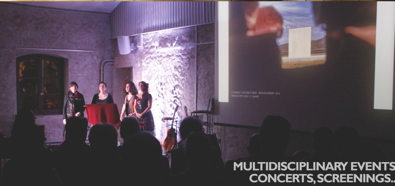
MULTIDISCIPLINARY EVENTS CONCERTS, SCREENINGS...